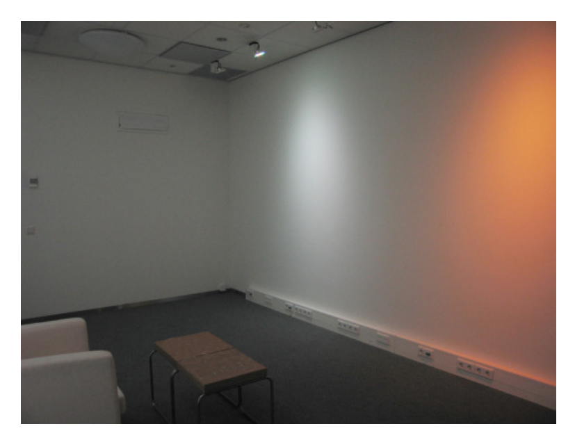
Figure 1: Spatial situation of the experiment with stimulus example.

position of the chromatic patch (left or right) and the order of presentation were randomized. After each trial the lighting was switched to provide achromatic general room lighting. This was present for a period of 10 seconds prior to each stimuli onset. Participants judged whether the left or right patch had a higher attraction value.