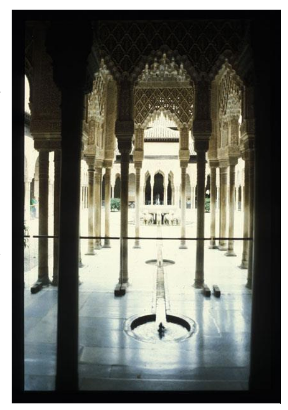
Figure 3: Alhambra palace, Granada (Spain)

My understanding was that the visual dynamics of movement and rhythm were created in the tiles and stucco through the busy intricate design work based on repetition, geometry, symmetry, colour balance, creation and inversion of form. These key elements gradually informed my work and led to a fundamental change of approach. The subject that once relied upon architecture as a pictorial structure was dropped, and colour became the catalyst to create movement, rhythm, pattern, visual ambiguity, and the means for a different quality of light (Figures 4 and 5). Colour