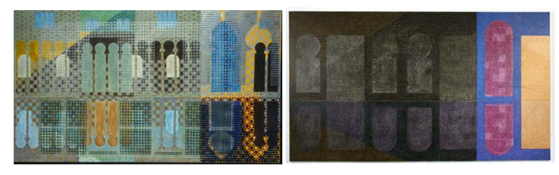
Figure 4: John Lancaster, Sacred Interiors *3 no.3, oil and acrylic on canvas, 140×245cm, 1999. Figure 5: John Lancaster, Sacred Interiors *4 no.3, oil on canvas, 160×245cm, 2001.

previously referred to nature or the objective world for inspiration. I looked outwards to draw in ideas for colours to use within the work. Now the decision making process regarding colour looked inward to the process of painting itself, based upon the experience gained through experimentation, improvisation and critical reflection supported by an understanding of colour theory. Colour becomes the vehicle for change but also, to a greater extent, the purpose for experimentation.