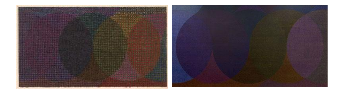
Figure 7 (left): John Lancaster, Sacred Interiors *4 no.3, oil on canvas, 160×245cm, 2001. Figure 6 (right): John Lancaster, Sacred Interiors *3 no.3, oil and acrylic on canvas, 140×245cm, 1999.

the painting can be seen as part of a shared cultural experimentation amongst contemporary painters. James Hugonin discusses a similar objective in reference to his paintings of the late 1980s in which he states 'things continually disappear and reform: things do not stay the same...what I am trying to do is to present the evanescence of things, to heighten the fact that everything is in essence transitory' [7].