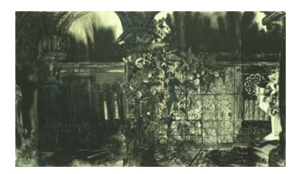
Figure 1: John Lancaster, Art and Religion, charcoal on paper, 195×336cm, 1997.

The second revelation regarding the mystery and intrigue of pictorial construction was discovered through Caravaggio's use of space. The spatial ambiguity in The Taking of Christ, 1602 [4] where forms appear and disappear out of shadow in a flurry of visual activity, and in The Supper at Emmaus 1602 [5] where the illusionistic play of space in relationship to the picture plane is explored, inspired me to think about experimenting with certain pictorial devices that aim to trick and deceive the eye into ever more subtle and secondary readings of a painting (Figures 1 and 2). These may well serve to underpin and support the subject but may also provide a counter balance or alternative reading to the subject or narrative of the painting.