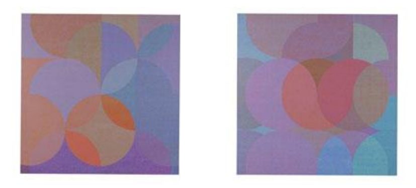
Figure 8 (left): John Lancaster, Hidden Connections 1, oil on canvas, 180×180cm, 2008. Figure 9 (right): John Lancaster, Hidden Connections 2, oil on canvas, 180×180cm, 2009.

What is interesting about these observations is their recognition of truly surprising nature of the transformation of a painted surface, of a palette that has been created out of saturated colour on the painted surface, with the retina responding in quite a different way with unexpected results. I regard this capacity to transform the ordinary into the extraordinary as a further wonder of the act of painting and colour. To some extent we are familiar with the concept of colour and light being generated as optical phenomena in the experimentation of the Impressionist painters, but what is noteworthy is that this fascination has been regularly revisited and explored by painters throughout the 20<sup>th</sup> and 21<sup>st</sup> centuries.