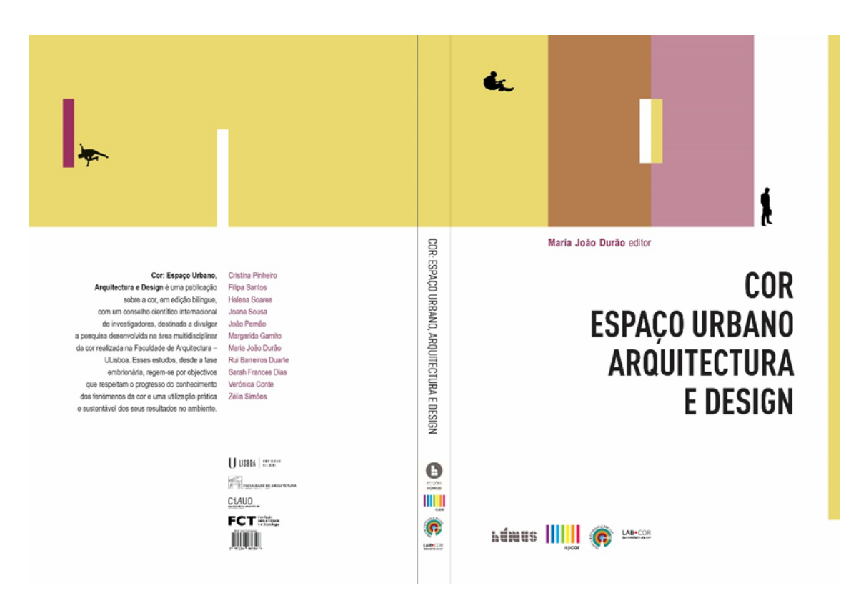
Figure 2: Book cover-Portuguese version.