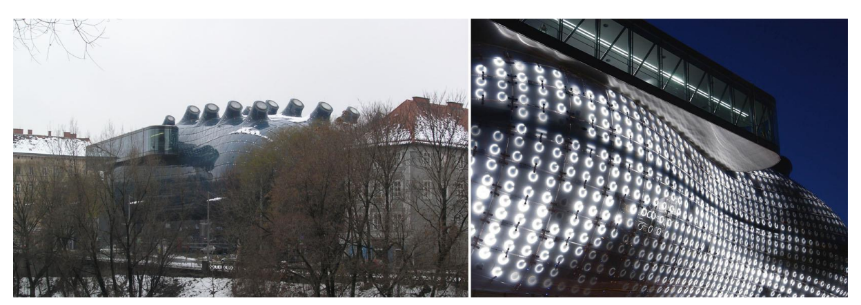
Figure 3: Art Museum Graz, by day and (left) and by night with activated BIX system (right)

Today the media surfaces are comparable to a television screen, transmitting to the user image and sound information in the form of an electronic signal visible on a display. In this case the user plays a passive role: he/she is a spectator. This is the way that many urban screens and media surfaces work because they have only a commercial function and they are not interactive.