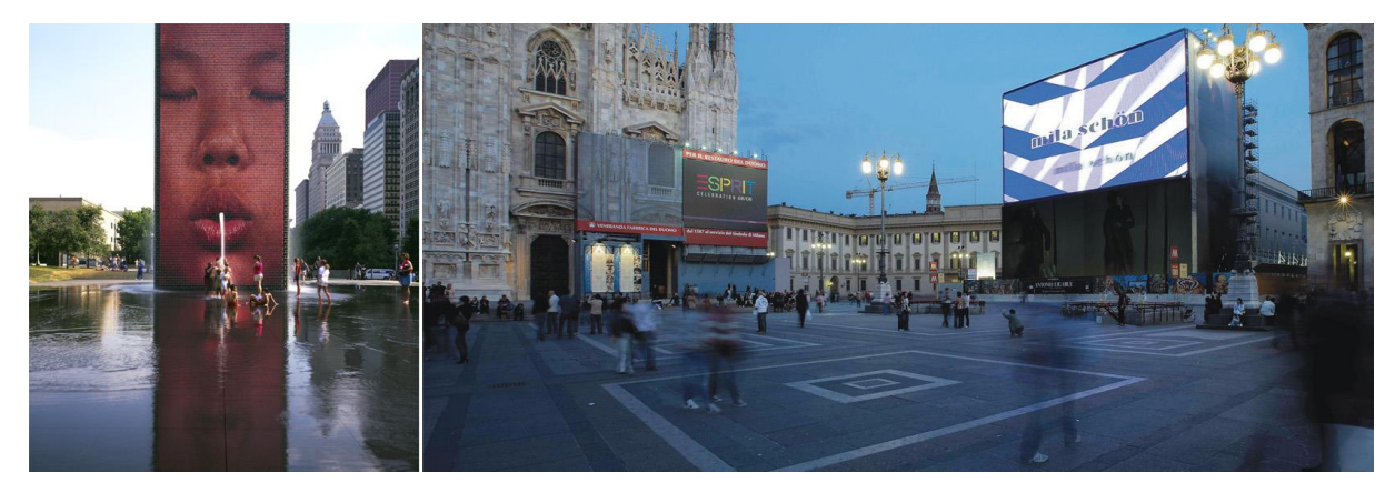
Figure 1: Crown Fountain, Chicago, Jaume Plensa and Krueck+Sexton Architects © Photo: Krueck+Sexton Architects (right). Figure 2: M.I.A.–Milano in Alto, temporary urban screen, Milan © Photo: Francesco Carcano (left).

As regards the examples mentioned above, the colours used are the ones of the additive synthesis, the ones used for the computer systems and for the digital screens: RGB—Red, Green, and Blue—in several tone and intensity variations and exploiting the LED brightness.