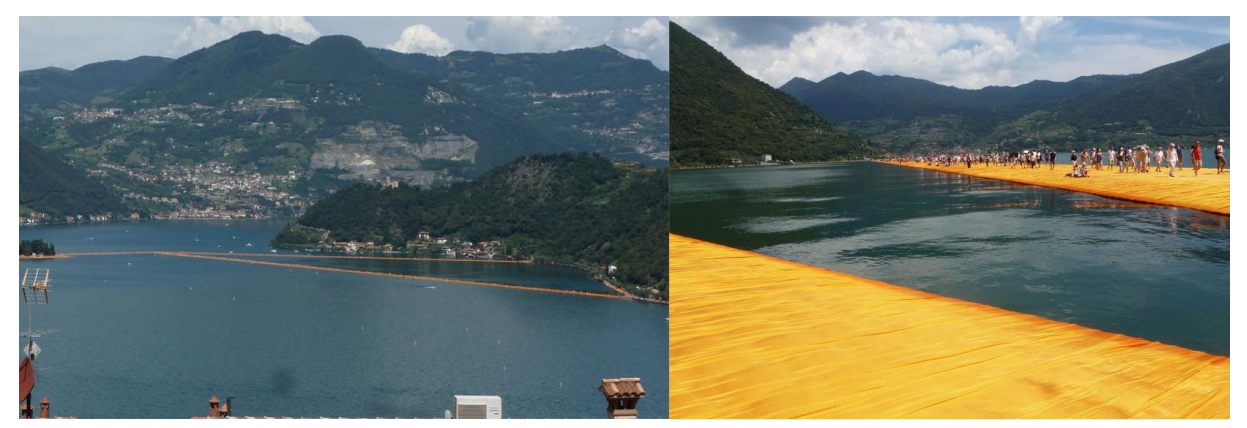
Figure 9: The Floating Piers by Christo and Jeanne-Claude, 2016, Lake Iseo, Italy. A temporary land art installation ©Photo: Katia Gasparini.

Christo and Jeanne-Claude's installation " The Floating Piers " on Lake Iseo (Italy) is a land art design (Figure 9). It is a temporary project and a floating 3km long pier, a freely accessible walkway across the Lake Iseo waters made up of a modular floating dock system of 200,000 high-density polyethylene cubes covered by 70,000 square metres of yellow-orange fabric.