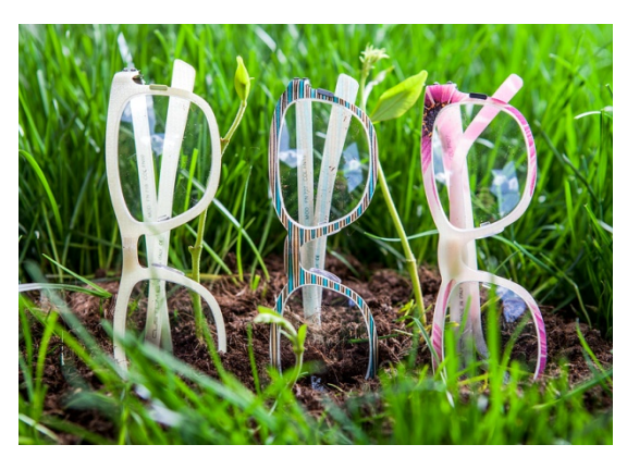
Figure 2: Custom-6 realised natural philosophy where ecological and natural concepts are chosen with the material, handcraft philosophy and Italian production.

In such a way, for example, the natural linen spectacles realised in 2012 by the Italian Custom-6 cannot openly expose its 100% natural composition, and it is advertised with an image locating the product on a green lawn (Figures 2 and 3).