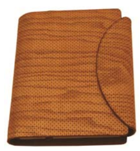
Figure 1: Ligneah, mix of technology and handcrafted qualities, bag in wood with tactile and appearance properties of leather and textile.

For a long time in order for many products to immediately prove 'green' they have been mainly conceived in a green nuance or with a pattern and surface oriented at the imitation of the so-called 'natural' materials (Figure 1).