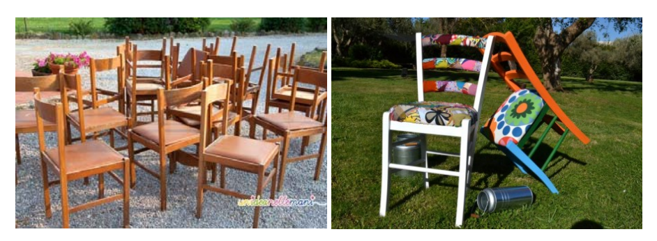
Figure 11: Plinca Home realise a series of chairs crafted through the re-interpretation of the traditional tavern chairs, transformed through colour and decoration in eclectic and unique objects.

Also the interesting work of Simona Incatasciato and Massimo Pluchino is based upon recycling, although with a different approach. They do not recycle materials, but the whole chair. The two Sicilian designers from Modica realised for Plinca Home a series of chairs crafted through the reinterpretation of the traditional tavern chairs, transformed through colour and decoration in eclectic and unique objects. They are the fruit of craftwork being unique and readable at the same time, and combine colour and creativity with functionality generating objects whose differences appear even in the smallest details (Figure 11).