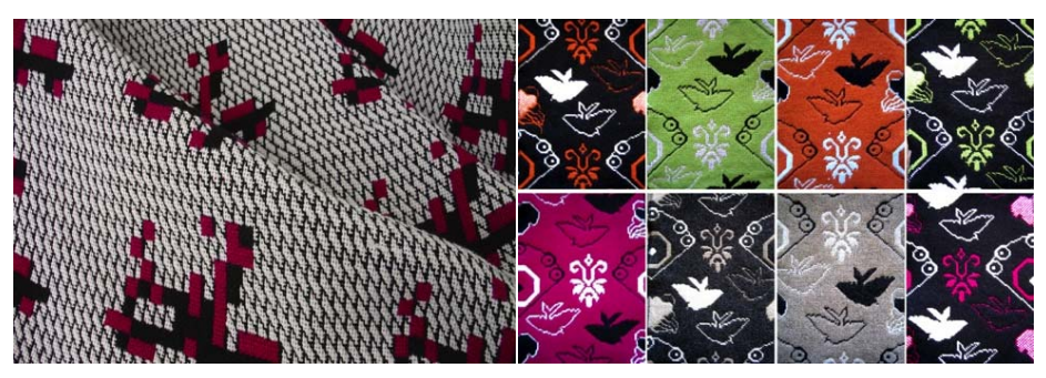
Figure 8: Lanificio Leo, from the joint use of late-Nineteenth-Century machines with Fifties' ones, generating contemporary colour and design textiles.

with Fifties' ones, generating contemporary colour and design textiles. In such a way the 'punto pecora' was revamped with abstract elaboration of signs which become element of a Jacquard-kind technology being brought to the limit; it re-elaborates the traditional fishbone theme. 'Punto pecora' is adopted in various scales (S, M, L) as minimum unit to create textiles belonging to a single family (Figure 8).