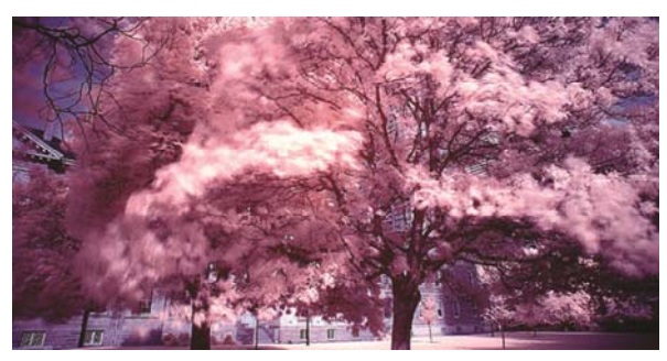
Figure 5: Bio-Led, optained by nano-particles of gold, implanted in some plantes, to optain a bio-luminescence.

Colour as planning element: Colour is also a planning element, since it can be programmed through interaction with some natural elements, changing them according to the occurring needs. In this way the most recent nano-tech research works unfolded a series of new opportunities for the planning processes, through the laboratory creation of natural materials and phenomena such as the interesting discovery of a group of scientists co-ordinated by Professor Yen Hsun Su in Cheng Kung University of Taipei. This Taiwan group observed that installing golden nano-particles, similar to sea urchins, in Carolina Bacopa plants, the leaves produce a bright reddish aura: this means that they generate light through golden particles, and facilitate the natural bio-luminescence of clorophyll. This could be imagined as the bio-LED of future, and it could be adopted to illuminate streets at night, trasforming trees in coloured street lamps (Figure 5).