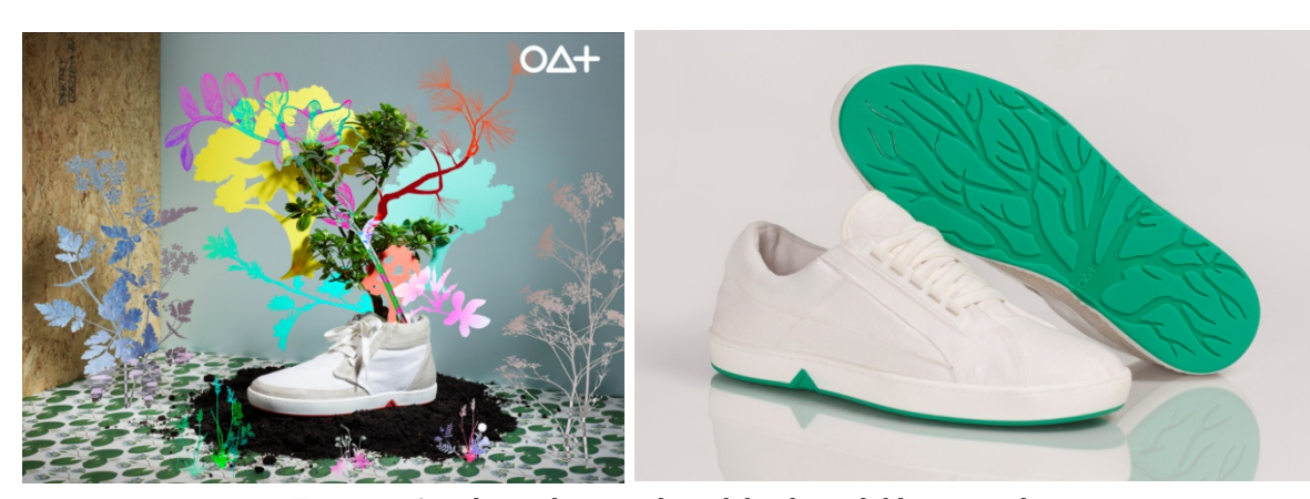
Figure 3: Oat shoes, shoes made with biodegradable materials.

Otherwise, in the promotion strategies of the biggest international holdings such values are communicated by widely known personalities able to grant trustworthiness. A recent example of such a strategy is the extremely light and ecological soccer shoe realised by Nike for the Brazilian champion Neymar; it only weighs 160 grams, it is made with the recycled fibres of the Brazilian 'mamona' plant which is widely farmed in Brazil and also used to produce bio-diesel fuel; the message is conveyed towards the whole society by this soccer star.