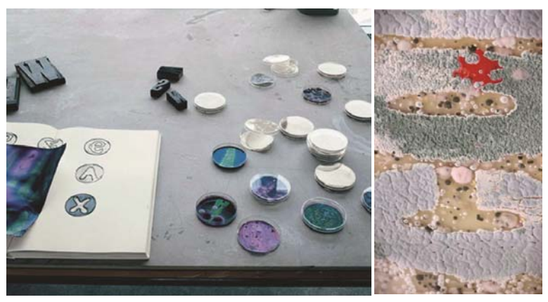
Figure 4: Jelte van Abbema, Symbiosis, 2009. Sperimental project of typography generated by bacteria proliferation.

Colour as alive element: In such a framework also colour becomes a changing and alive element (e.g. in its relationship with time), or non-invasive element, able to support changes in search of a perfect symbiosis with the environment. In this way the relationship with science and biology becomes a natural expression of the object. For example, in 2000 Oron Catts and Ionat Zurr founded SymbioticA, a lab devoted to study and research of life sciences. This laboratory generated the most interesting 'bio-inspired' experiences [8] carried out by designers such as Lehanneur, Revital Cohen and Susanna Soares; in 2008 it was hosted in the MoMA exhibition 'Design and the Elastic Mind', curated by Paola Antonelli: it presented some products incorporating alive beings, and generating interactive and sensitive profiles of colour. Very interesting among these were the projects using bacteria and cells which, once cultivated, generate typographic characters and posters in continuous evolution since based upon the life cycle of multiplication and death of bacteria, such as Symbisios by Jelte van Abbema (Figure 4).