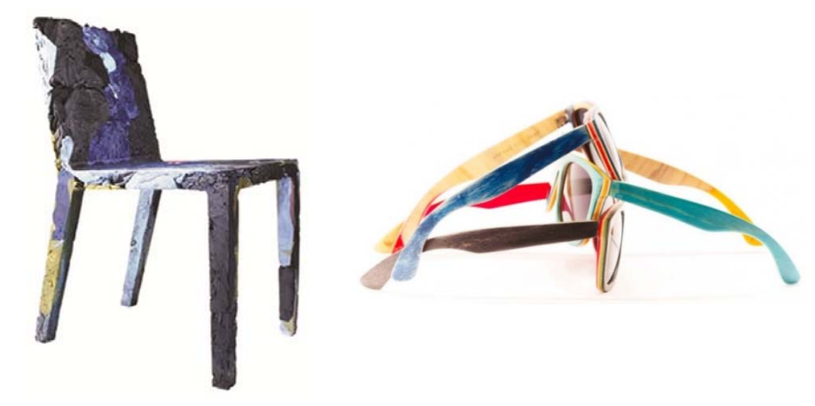
Figure 9 (left): Tobias Juretzek, chair Rememberme, Casamania. Figure 10 (right): Hip-Eco-Hop glasses, realised by Vuerich B and by Diamond Supply are made with fragments of skateboards, in maple wood layers of different colours, just in memory of the 'recent past'.

It may happen, for example, when the materials forming products need to be explicitly declared, showing the stratification of materials and colours. In such a way the chair Rememberme, realised by Tobias Juretzek for Casamania, is sustainable since it is produced with recycled denim, but is, above all, bearer of memories and certainly a unique piece, although industrial (Figure 9). in the same way the spectacles Hip-Eco-Hop realised by Vuerich B and by Diamond Supply (Figure 10) are made with fragments of skateboards, in maple wood layers of different colours, just in memory of the 'recent past'