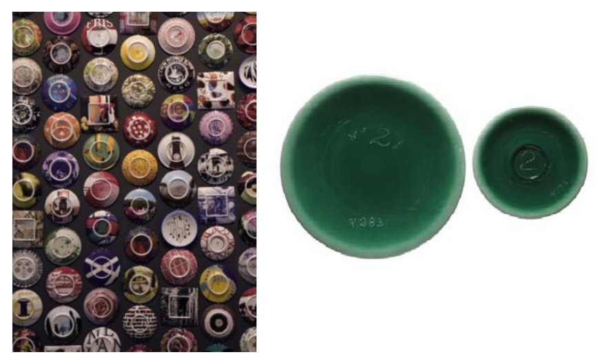
Figure 7: Richard Ginori, Italian company between tradition and innovation.

It starts from the 'roots' generating a new form of hybridation in which colour is an indispensable component (Figure 7).