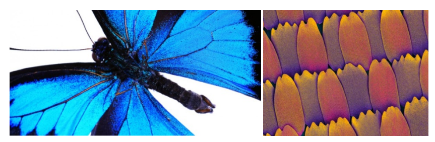
Figure 6: The reproduction of natural butterfly Papilio Blumei wings' structures can prove useful to settle industrial systems aimed at protecting safety of banknotes, credit cards and other documents preventing their counterfeiting.

Other studies have been based upon nano-technologies, observing the natural iridescence of colours in the wings of butterflies and other insects and using these micro- and nano-structures in ordinary products. In butterflies' wings colour does not depend upon pigments but upon specific micro-structures which reflect and refract light touching their surface, as is well known. The brightest colours are obtained when light interacts with surfaces with a periodic structure at micro- or nano-scopic scale. The complex structure of the Indonesian butterfly Papilio Blumei has been studied and artificially reproduced by Mathias Kolle, Ulrich Steiner and Jeremy Baumberg [9], Cambridge University researchers. In such structures, covered by many layers of flakes, alternated with concavities 5-10 micrometres wide and filled with air, light coming from different angles is reflected once or more times according to the direction and the wavelength, and polarised, creating very intensive colour effects.