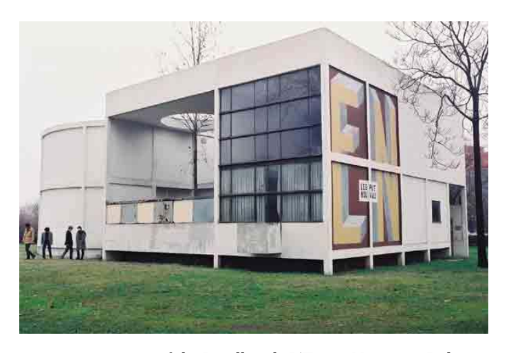
Figure 3: Le Corbusier, reconstruction of the Pavillon de L'Esprit Nouveau, Bologne, 1977, exterior view.

For colour, the program was to deploy it in the service of transforming a two-dimensional space into the illusion of a three-dimensional one, without recourse to classical perspective. Through the careful and controlled use of light and dark contrasts — chiaroscuro — they could use colour to imply depth. To clarify, they did not reject colour out right, but rather, assigned a highly specific role to it. Thus black and white, the most dramatic and volume-building hues, became primary colours in their depiction of architectural volumes in both two and three-dimensional space. At the same time, the predominance of black and white has led many to incorrectly believe that they abandoned colour altogether [5, 17, 22]. To the contrary, the Purists developed an entire theory of architectural colour.