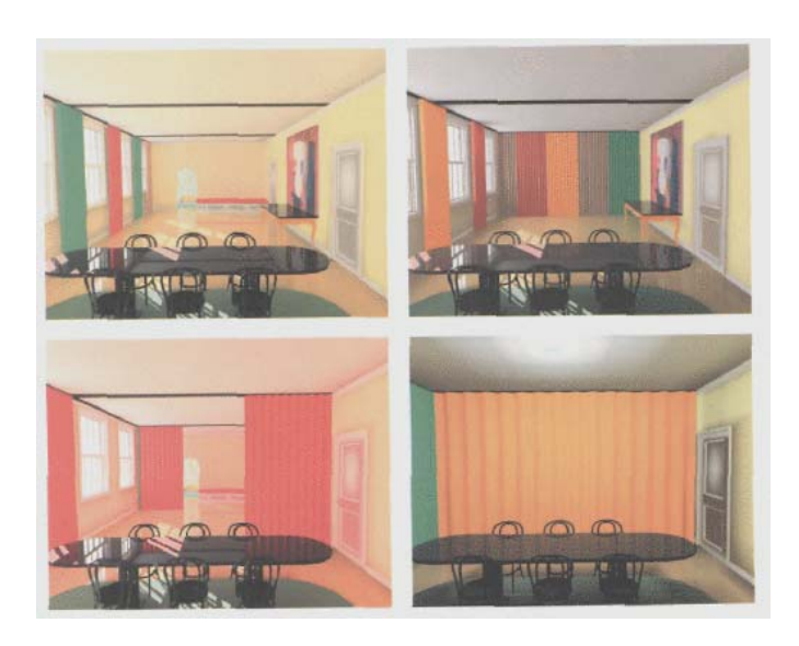
Figure 7: William Braham's digital reconstruction of Amédée Ozenfant's living room / colour laboratory in his London apartment.

intuitive psychology."<sup>6</sup>. His dual focus on the objective and subjective effects of colour is ultimately what allowed him to articulate a theory of virtual architectural colour. If "any of the more complex or more brilliant colours could be obtained by using simultaneous contrast with stable dull paints," then colour could feasibly be said to exist on a "virtual" plane. And thus his primary rule of solidity became: "A 'virtual' tint is always more attractive than the same hue in reality." In a full turn, architectural colour had become an experience, far from any absolute or supposedly objective form<sup>7</sup>. Broken and reassembled, modern colour entered the heart of modern architecture.