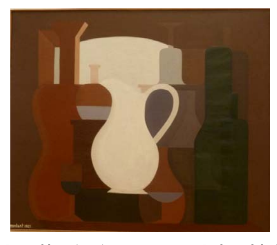
Figure 1: Amédée Ozenfant, Le pot blanc (1925), 151.5 × 176.5 cm. Light and dark contrasts are used to build architectural-volume within a two-dimensional plane.

Purist founders Charles-Édouard Jeanneret (1887-1965) and Amédée Ozenfant (1917-1925) met in Paris in 1917, after which they began an intense professional collaboration and close friendship. The bulk of their work consists of writings, paintings, and architectural projects made between 1918 and 1925 by Jeanneret and Ozenfant (Figure 1), with occasional contributions from Fernand Léger. Purism can be defined alongside, and in contrast to, a number of modern aesthetic movements, all of which emerged in response to the social and political conditions in Europe, and especially in Paris, after the First World War. At this time, a new streamline and mechanised aesthetic became both a style and political tactic to distance oneself from the excessive décor, ornament, and decorative techniques of the nineteenth century, alongside their equally heavy traditions and bourgeois ideology.