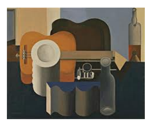
Figure 2: Le Corbusier, Still life. Objects are reduced to essential forms and volumes, also believed to correspond to a universal law of harmony.

Purism dealt in austere geometric forms, which they used to achieve a highly reductive and so-called pure universal aesthetic inspired by industrial machinery (see Figure 2). In other words, in a marked rejection of Cubism's multiple points of view and the Neo-Impressionists' attention to perceptual variations in light and colour, the Purists sought an objective portrayal of everyday mass-produced objects by way of necessary geometric form [16]. Cubism lacked this necessary and essential "narrative aspect," they argued and thus there was "no difference whatsoever between the aesthetics of a carpet and that of a Cubist painting." [17]. Even Fernand Léger, whom they worked closely with on early issues of L'Esprit Nouveau, held an approach to architectural colour that they soon dismissed as too "ornamental" and thus un-modern.