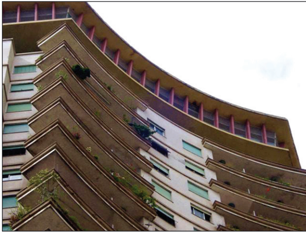
Figure 5 Focusing on the roof facade of building 'Viaduto'

Against all the architectural principles defended by the Brazilian elite of architects, mainly in relation to the 'correct' use of colour, Jurado's projects pleased and appealed to an emerging middle class that wished to display its opulence (Figure 5). Even nowadays Jurado's buildings are valued on the real estate market, and perhaps on account of their exotic character are coveted by intellectuals and artists. The fact is that, despite the criticism his work arouses, many of his projects and, especially, his colour schemes are deemed to be harmonious by a great number of individuals.