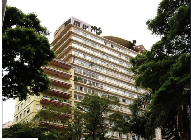
Figure 2 Building 'Bretagne', observed from a ground floor perspective