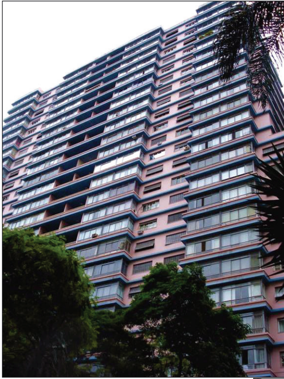
Figure 1 Building 'Louvre', portraying the importance of colour in Jurado's constructions

a phase of considerable architectural activity under the remarkable influence of the Modern Movement in Architecture, which highlighted the work of certain professionals such as Vilanova Artigas, Lúcio Costa, Rino Levi, Afonso Reidy and