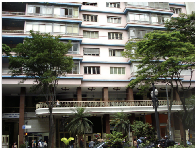
Figure 6 Focusing on the doorway of building ‘Viaduto’

The chromatic schemes found in Jurado’s work are far from indicating unanimity among their aspects of harmony, even when they display chromatic diversity as their main feature (Figure 6). On the other hand, in principle, chromatic diversity comes up as one of the elements that would characterise a harmonious combination.