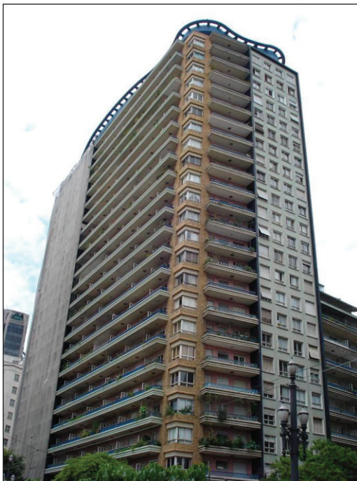
Figure 4 Building 'Planalto', an example of opulence in Jurado's work

Jurado's great virtue resided in his ability to recognise and address the aspirations of an emerging middle class and to create differentials that would make his projects attractive to that particular public; for example, communal swimming pools, big party halls, car garages, children's playgrounds and solariums. In addition to the aesthetic visual quality of his projects, his designs represented features that ensured commercial success for his buildings and gained him a high reputation as a businessman in civil construction. His architecture paid homage to Oscar Niemeyer [3] but using a proposed, ornamental and chromatic approach rather different from that of Niemeyer's – to such an extent that his opponents were led to define one of his projects as 'Barbie's house projected by Oscar Niemeyer'. This very same project – the building