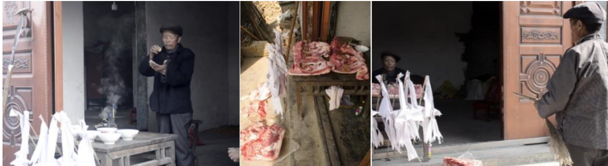
Figure 1: Chizhu (eating a pig) Ritual performed by Badaixiong and Badaizan together in Kejia Village, Heku Town.

In Fenghuang County, Badai is also the indigenous term for ritual specialists, a career for men only, which generally falls into three categories: Badaixiong (Miao: baxdeibxongt); Badaizan (Miao: baxdeibruanx), and Badairuan. The first two types are most common that can be seen in almost every village.