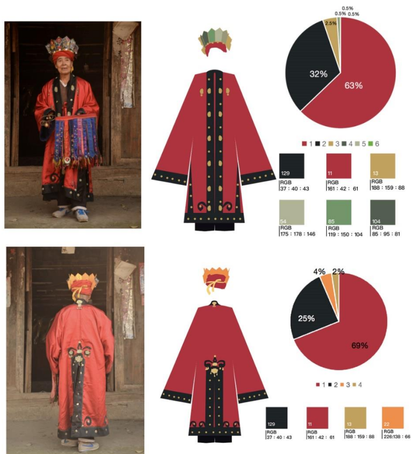
Figure 5: Color analysis of Badaizan's religious clothing.

In specific, Badaizan wears a red robe, a red headscarf, and a phoenix hat. The red robe is also known as Celestial Master Robe, or aox qinl in the Miao language. It is a deep V-neck cardigan robe, reaching down to the ankle, which facilitates them expelling evil ghosts. The red headscarf is wrapped around the head which should hide hair but not ears [5].