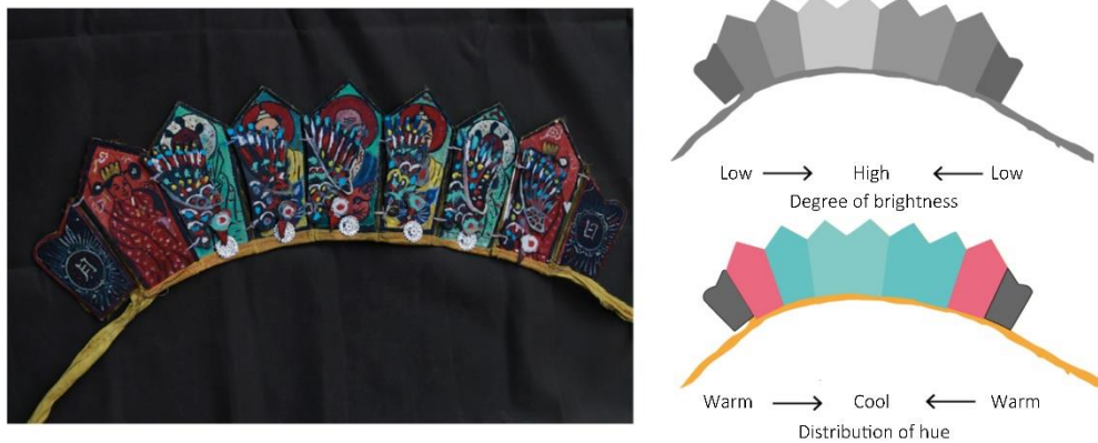
Figure 6: Color analysis of Badaizan's Headgear Phoenix Crown.