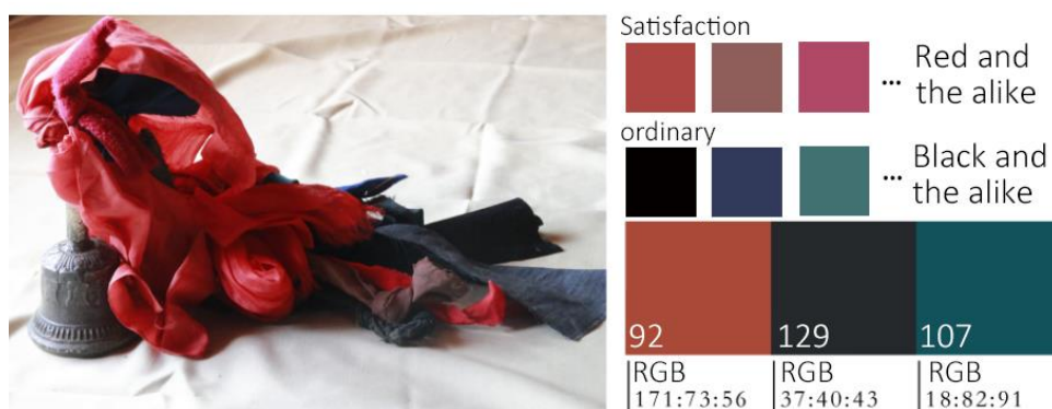
Figure 2: The symbolic meaning of colors of the cloth strips on Jinling.

Jinling , (kenmai in the Miao language), has a copper clapper inside that rings when struck. It is mainly used for supplicating ancestors. The number of cloth strips on the bell stands for the length of employment, and the color for the degree of satisfaction, with red and the alike (such as brown red and brick red) indicating a high degree, while black and the alike (such as dark blue and dark green) a relatively low one.