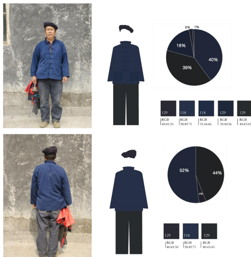
Figure 4: Color analysis of Badaixiong’s religious clothing.

The color of Badaixiong’s religious clothing is mostly blue, with a low value (brightness), saturation, and contrast. This color combination gives an impression of solemnity, awe and authority, which goes hand in hand with Badaixiong’s main duty to communicate with ancestors.