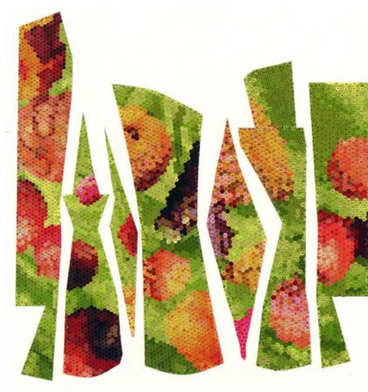
Figure 8: Final colour composition showing the distribution of small hexagonal tiles on the roof [Photo courtesy: EMBT architects].

Santa Caterina market follows this symbolic or abstract tradition of reducing the colours of reality to arrange them in buildings, as mentioned before with regard to modernist architecture in Valencia. There are many examples in contemporary architecture that use pixilated photographs in their composition.