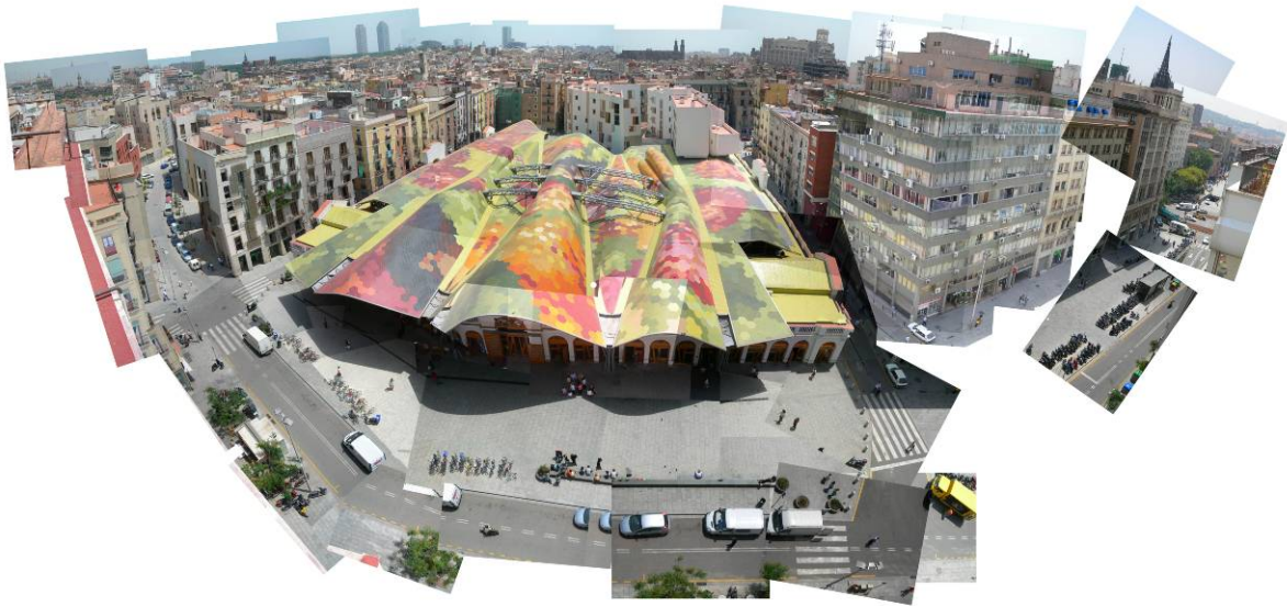
Figure 5: Top of the roof – Santa Caterina market, Enric Miralles and Benedetta Tagliabue, Barcelona, 2005 [Photo courtesy: EMBT architects].

The composition of the colours of the roof was obtained from the image of a market food stall after a digital treatment was used to reduce the colour information. The result of this abstraction process enabled a reduction to 64 colours and so facilitated the laying of ceramic tiles and their industrial treatment (as shown in Figures 6 and 7). Red and orange shades prevail over a large background with green ranges, enhanced by a simultaneous contrast between complementary colours that brings more vibrancy to the set. The bluish colours are almost nonexistent, although there are violet hues in the darker shades (in the same way impressionists painters used these colours to ‘cool’ the shadows). Every tile has a glossy finish that reflects sunlight and gives even more visual variety to the structure as daylight advances.