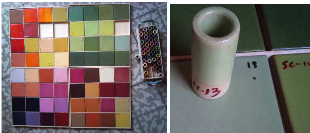
Figure 6 (left): Small samples of coloured glass tiles, showing the 64 shades selected.

The composition of the colours of the roof was obtained from the image of a market food stall after a digital treatment was used to reduce the colour information. The result of this abstraction process enabled a reduction to 64 colours and so facilitated the laying of ceramic tiles and their industrial treatment (as shown in Figures 6 and 7). Red and orange shades prevail over a large background with green ranges, enhanced by a simultaneous contrast between complementary colours that brings more vibrancy to the set. The bluish colours are almost nonexistent, although there are violet hues in the darker shades (in the same way impressionists painters used these colours to ‘cool’ the shadows). Every tile has a glossy finish that reflects sunlight and gives even more visual variety to the structure as daylight advances.